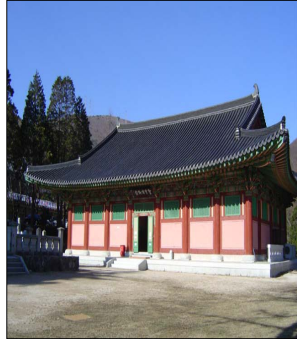
Seoul October 6/7