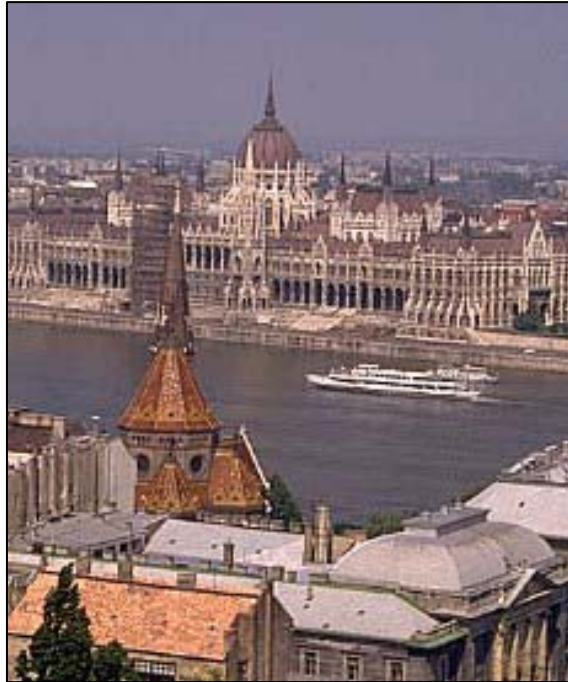
Budapest April 21/22